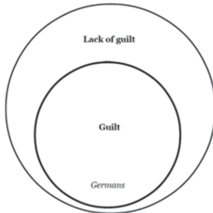
1. Guilt undifferentiated

The famous differentiation of guilt presented by Jaspers in the book The question of German guilt (Die Schuldfrage) (Jaspers, 2000) is based on distinction of four kinds of guilt: criminal guilt, political guilt, moral guilt and metaphysical guilt. The philosopher made this distinction with the intention to show Germans a way to personal acceptance with dignity of the clearly recognized