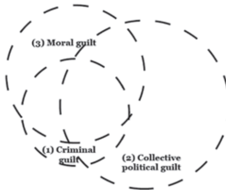
3. Blurring the differentiation of guilt

Tangling different kinds of guilt, up to the level of undifferentiated guilt, could lead to the accusation of the German nation as a whole. There is also an opposite direction of taking the burden of any guilt off the German nation — or at least some part of guilt, with an ever-progressing process of blaming the innocents.